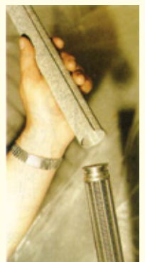
New filter hose is pushed over the support